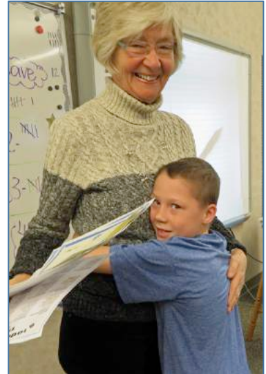
Some grateful recipients of BUG awards at Eagleside Elementary School.