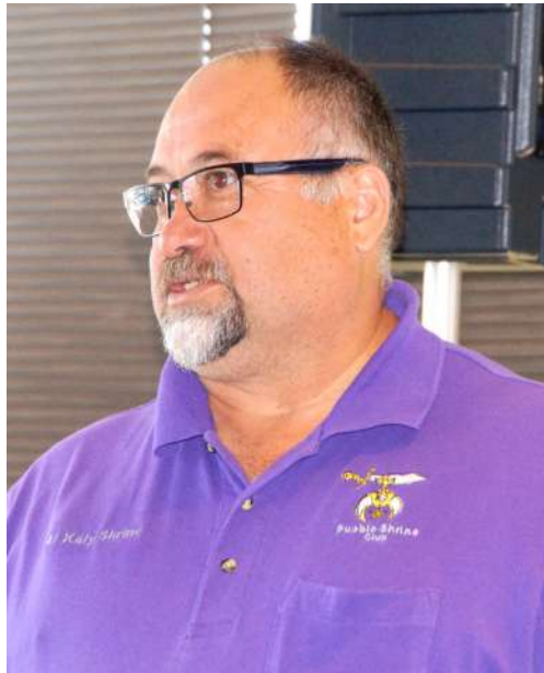
James Hinojosa Shrine Softball Tournament