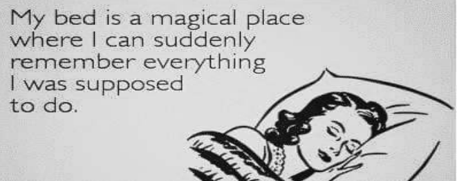
Seniors' Memory Recovery Program