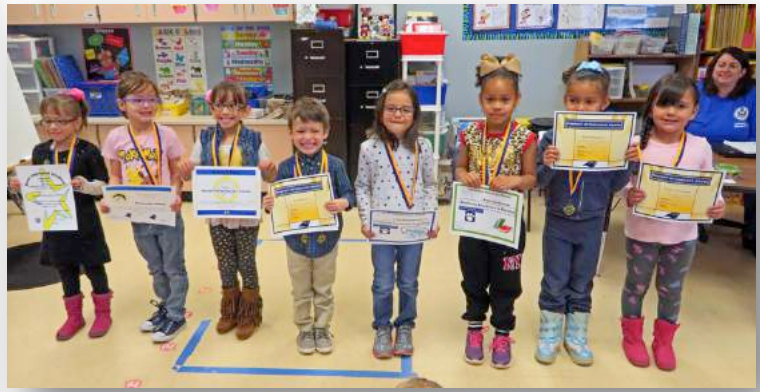
Love those proud, happy BUG kids at Centennial.