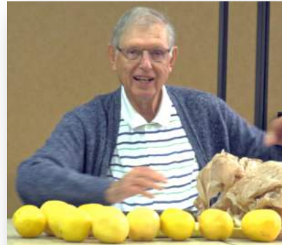
Burl's health tip of the day: Grapefruit for all!