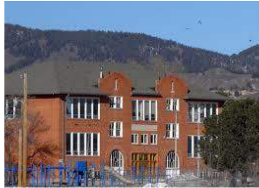
Lewis Palmer D-38 Administration building (a.k.a. Big Red) 146 Jefferson Street, Monument, CO 80921. Please use the West or North entrances!