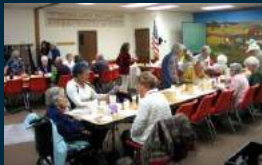
Senior Meals Drivers