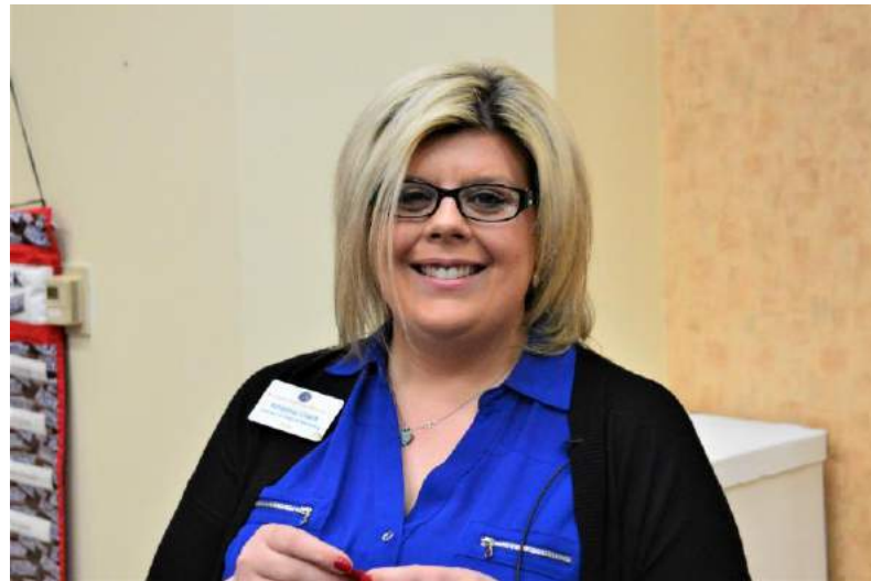
Bethesda in Monument