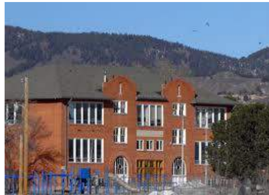
Lewis Palmer D-38 Administration building