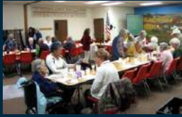
Senior Meals Drivers

Meal Delivery Location Mennonite Church - Hwy 105 Delivery Days Tues, Wed, Thurs