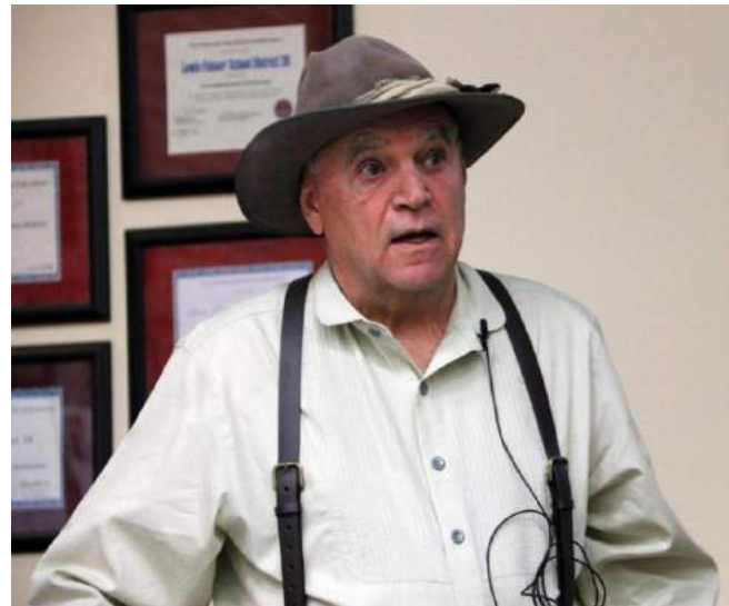
Western Emigration using Milking Devon Oxen