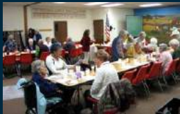
Senior Meals Drivers