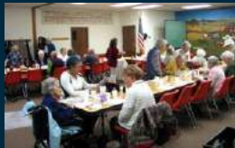
Senior Meals Drivers