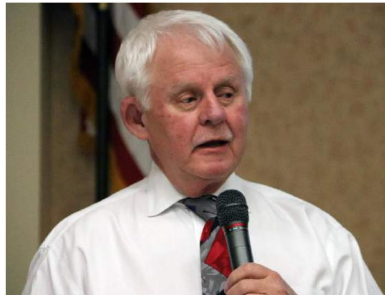
Tax Law Changes