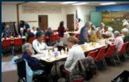
Senior Meals Drivers