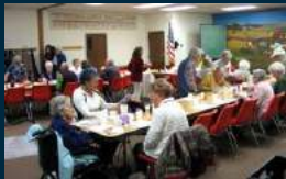
Senior Meals Drivers