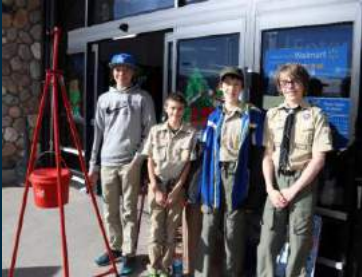
Great Boy Scouts support!