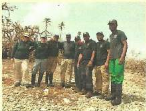
Current 2018 Cayo Santiago Research Team