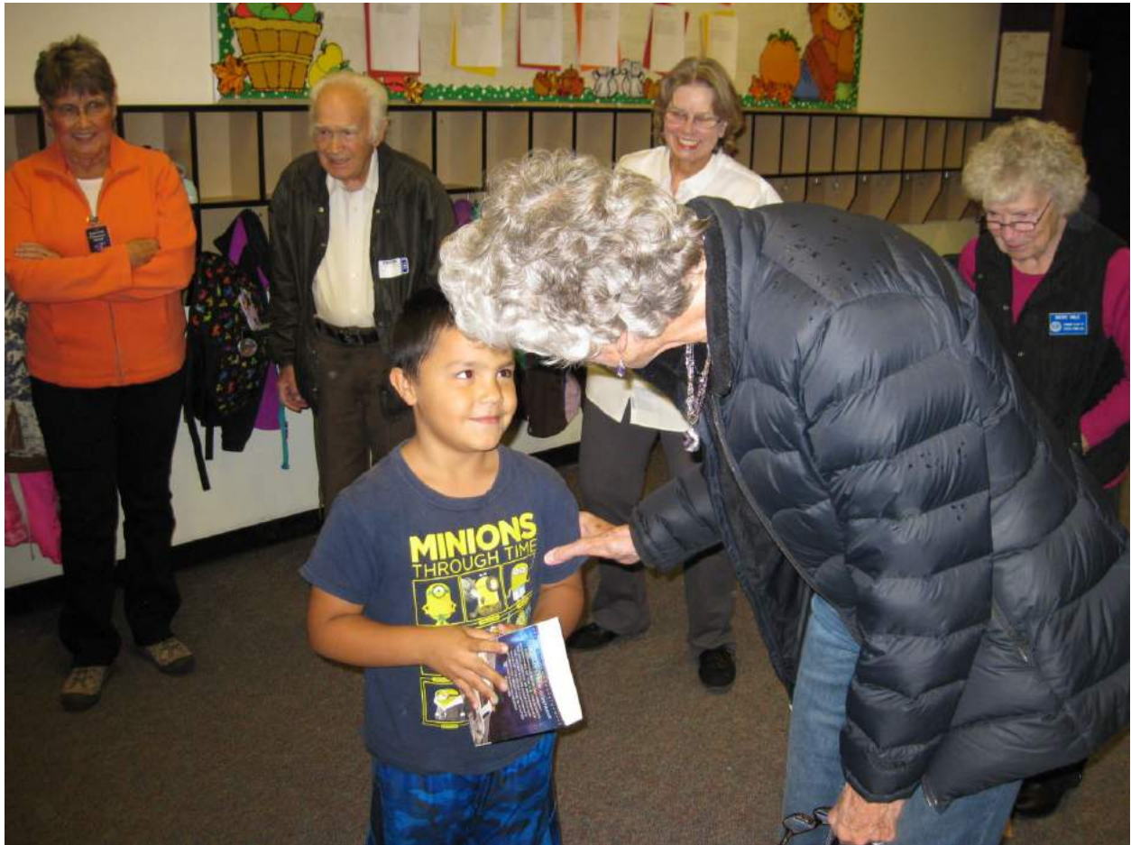
One delighted recipient and a few happy Kiwanians!