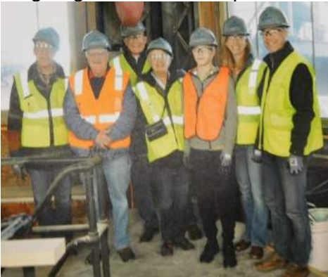
Tour group to capital