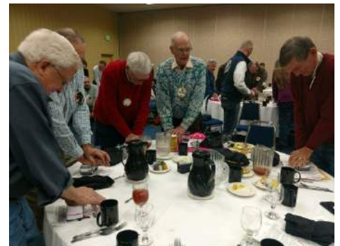
Kiwanians demonstrating chest compressions