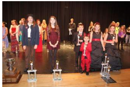
Best in Show Jr. High 1 st , Sr. High 1 st and Elementary 1 st