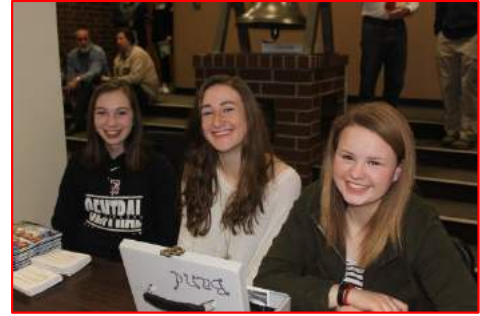
Central Key Club Selling Tickets