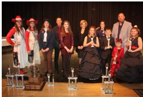
Stars of Tomorrow Winners and Judges