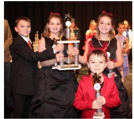
Elementary 1 st Place, Best in Show Elementary and