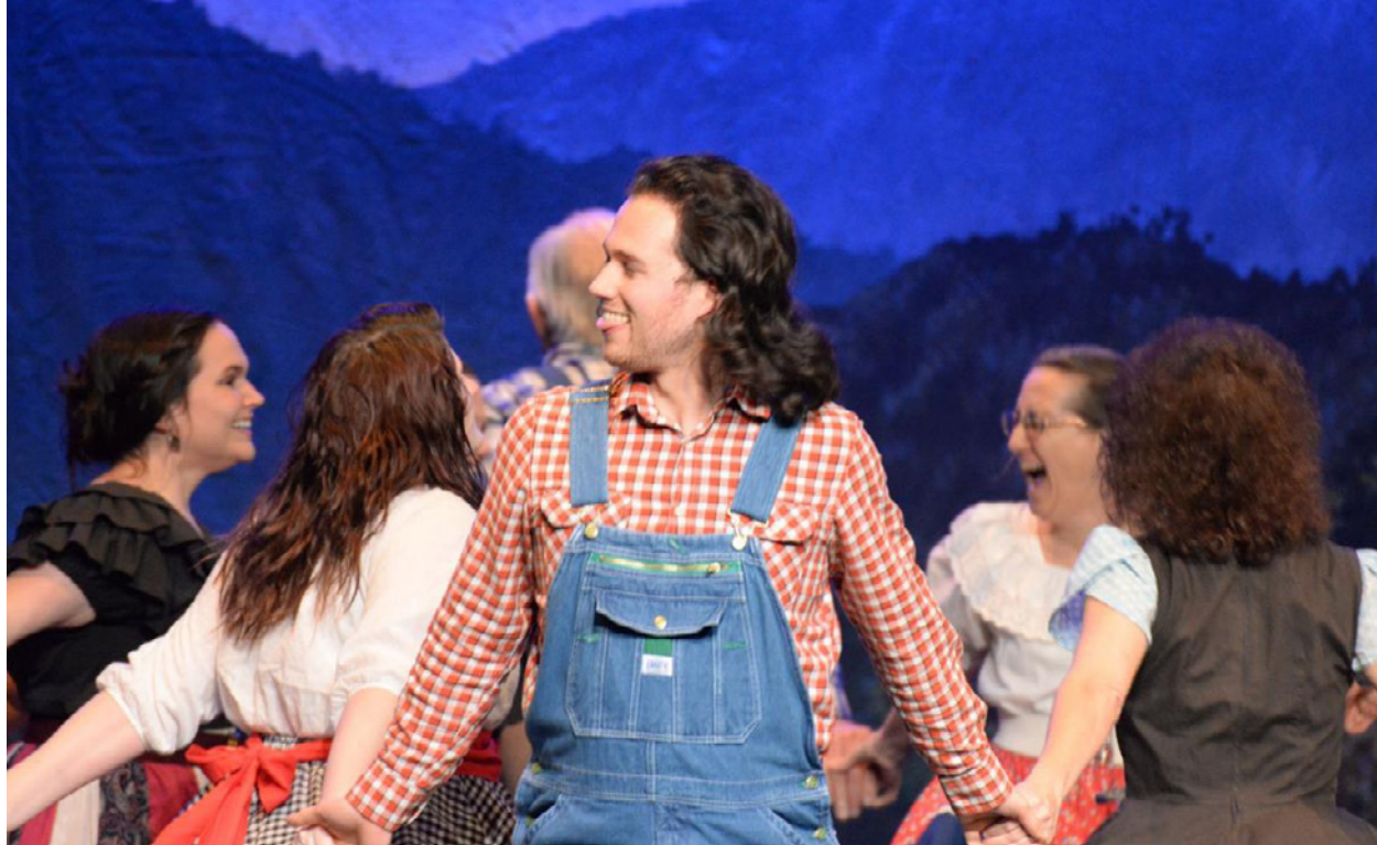
The J. Creek Cloggers perform at the Waynesville Kiwanis Cabaret Variety Show