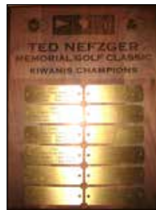
Kiwanis Traveling Trophy

Clubs with four or more players will receive Interclub Credit