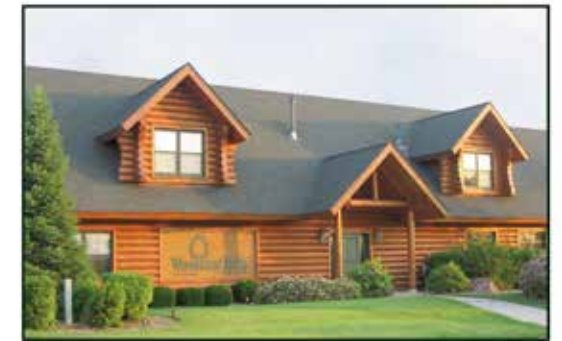
WOODLAND HILLS GOLF CLUB 6000 WOODLAND HILLS DR., EAGLE, NE