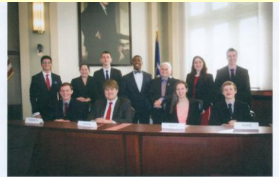
New Visions Law & Government Class of 2015 2015 New York State "We The People" Champions