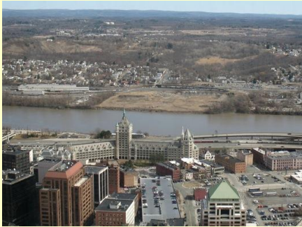
(view of casino site from Albany)