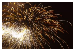
HAPPY NEW YEAR!