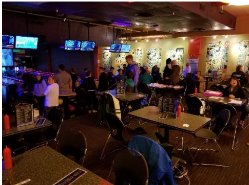
It was a full house – 4 each on 6 lanes

SERVICE: 3 hours – We took time to make our annual Valentines Cards for loved ones, a very popular service project. Supplies were obtained ahead of time and provided by the Kiwanis Club of Kirkland. The blank cards were decorated using pens and stickers; with envelopes addressed, too.