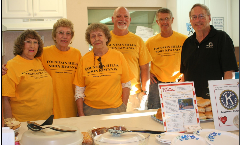
Lining up for some awesome service just prior to dishing out dinner.