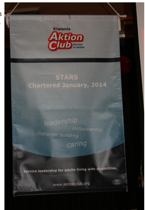
The Aktion Club of STARS banner.