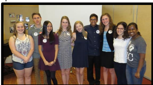
West Key Club, Edgewood Key Club and Edgewood Circle K members.

Program: Members of Edgewood College Circle K, Edgewood High School Key and Madison West High School Key Clubs shared their club activities which were quite extensive and too numerous to list.