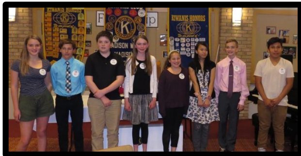
Recipients of the Madison West Kiwanis Middle School Awards.