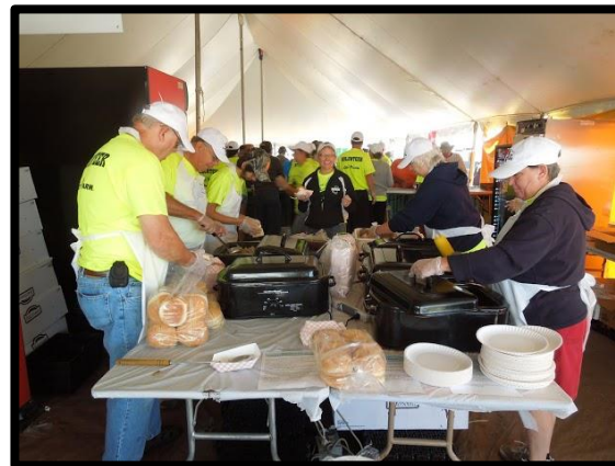
Food prep area in a food tent during the 2014 WI Farm Technology Days in Portage County

The map on this page should be helpful for directing you to the show site. Law enforcement people should be staffing the intersections near the show at 8:00 am. Parking volunteers are expected to be in place by 7:00 am.