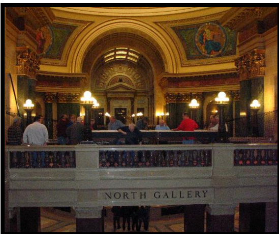
Setting up the stage for the Christmas Pageant