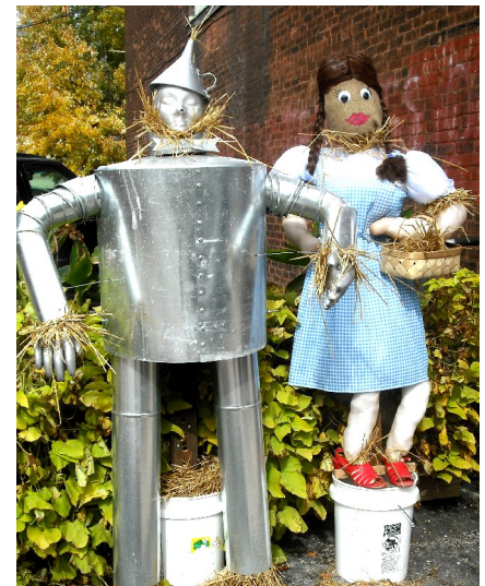
Coming to Lakewood soon!