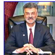
Mayor Frank G. Jackson Mayor City of Cleveland