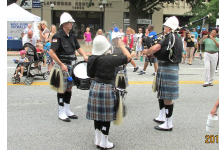
The pipe & drum trio were on hand at The Lakewood Arts Festival.