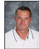
August 19 th Business Meeting