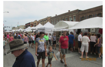
The thin cloud layer begins to move in.