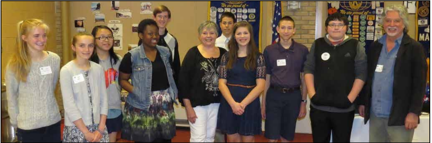
The Madison West Kiwanis Club honored nine Madison-area middle school students for high academic and extra-curricular achievement.