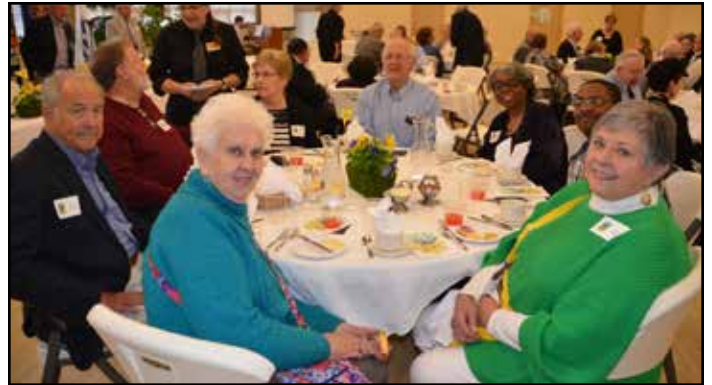
Members and friends helped Madison East celebrate their anniversary.

A sixty-year photographic history entitled "Then and Now" was presented. Entertainment was provided by Ballet Folklórico de María Díaz, featuring students ranging from six- to fifteen-years-old, who performed Mexican folk dance. The dance group is closely affiliated with the Madison East High School Key Club, sponsored by Madison East Kiwanis Club.