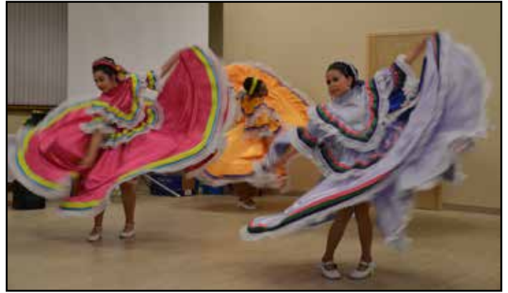
Ballet Folklórico de María Díaz performed Mexican folk dance.