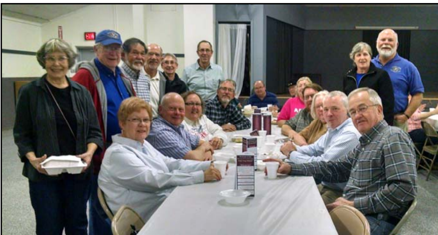
Club members and friends attend the Boone Pork Chop Dinner.